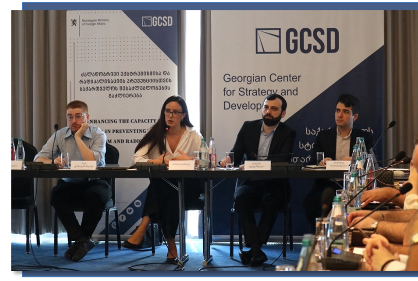
Strengthening Parliamentary Capacity - A three-day workshop was held for members of

Violent Extremism Risk Assessment Training - GCSD organized a three-day training program for representatives of the Ministry of Internal Affairs, the penitentiary service, and government administration to assess the risk of violent extremism.